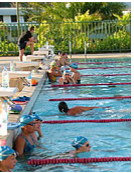
Training session at the 50m pool with the Swedish Club Tureberg and the Norwegian team NTG

We will never book more teams than can accommodate 4 persons/lane in the 50m pool and with access to the 25m pool for sprint sets. The training times will be 7-9am and 5-7pm to ensure that everybody gets good hours of rest in between practice. (If the complex is fully booked, 6.30-8.30am and 3.30-5.30pm or 8.30-10.30am and 5.30-7.30pm will be available, to ensure perfect timing between training, recovery and meals.) Other areas such as the Indoor Sports Centre and the gym are available on request.